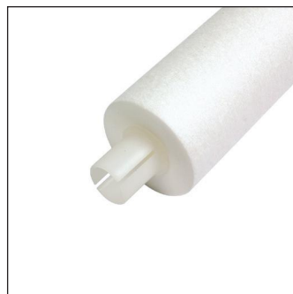
PP Core Extender