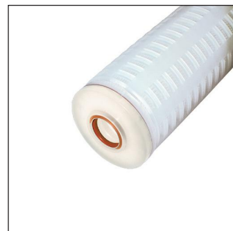
213 Internal O-Ring