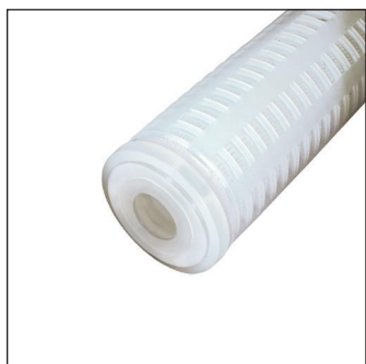
Flat (for 213)