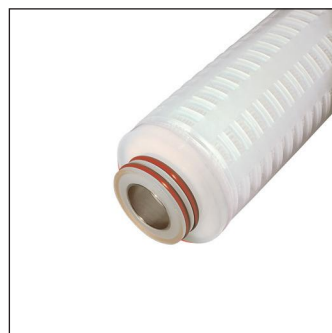
222 (w/SS Insert)