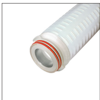
226 (w/SS Insert)