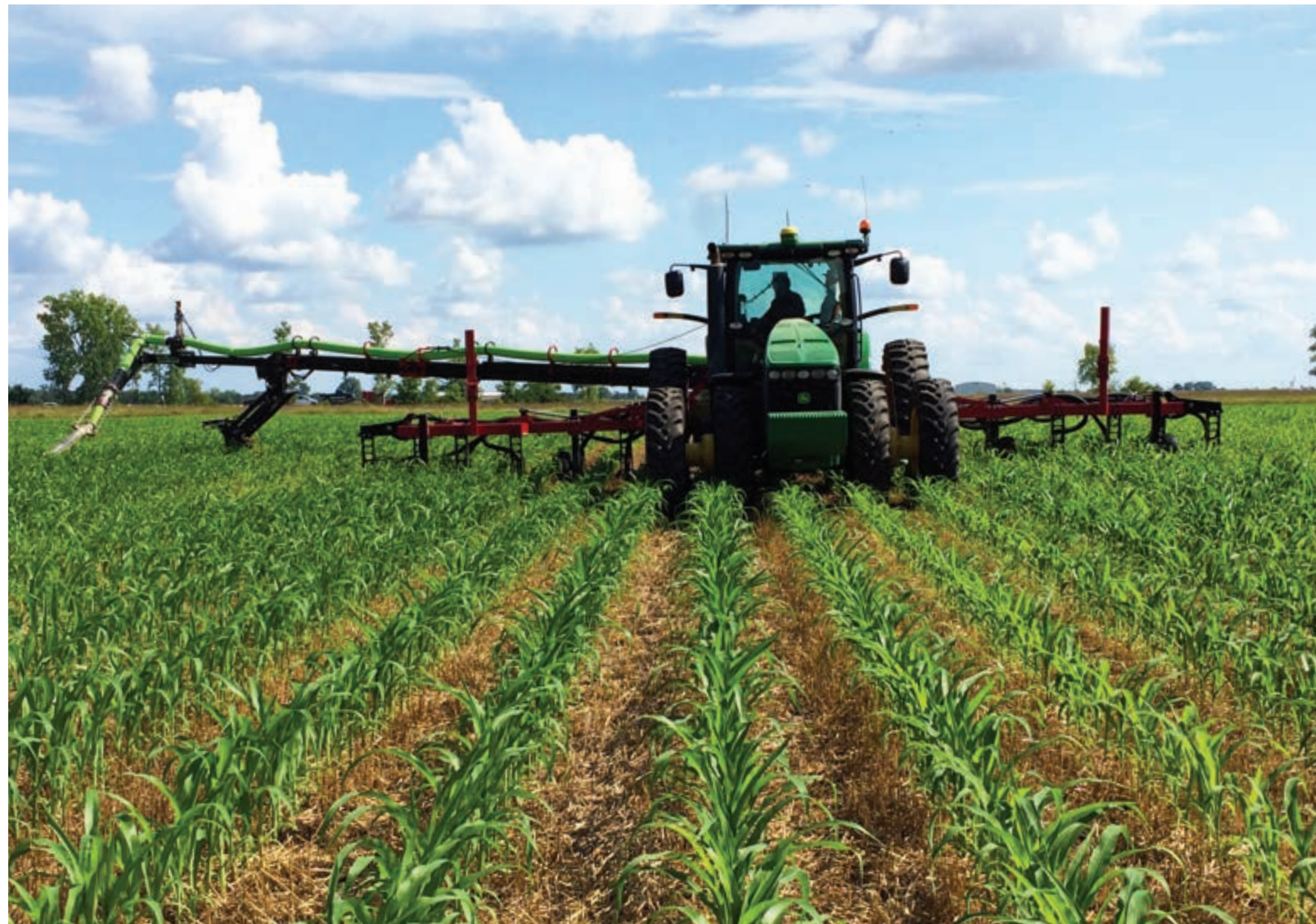
Continuous Manure Applicator - For side dress in row crops