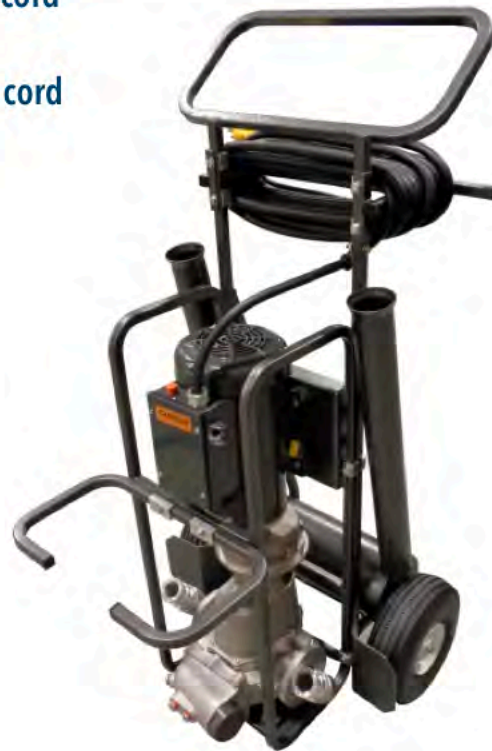
Shown without Hose & Nozzle Kit