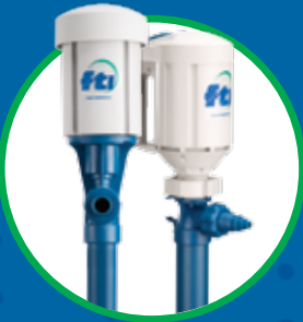
DRUM/BARREL PORTABLE FLUID TRANSFER SOLUTIONS