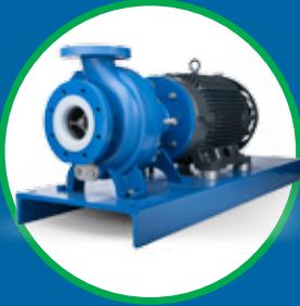
UC SERIES ANSI DIMENSIONAL MAGNETIC DRIVE PUMPS