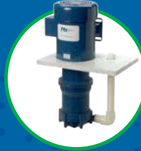
VKC SERIES VERTICAL MAGNETIC DRIVE SEALLESS CENTRIFUGAL PUMPS