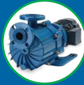
DB & SP SERIES PREMIUM MAGNETIC DRIVE SEALLESS CENTRIFUGAL PUMPS