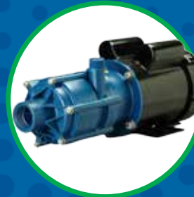
MSKC SERIES MULTI-STAGE MAGNETIC DRIVE SEALLESS CENTRIFUGAL PUMPS