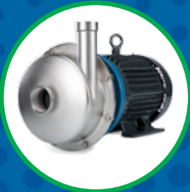
AP SERIES SEALED STAINLESS STEEL CENTRIFUGAL PUMPS