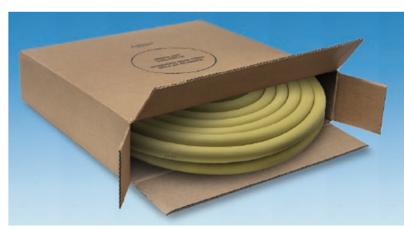
Shipped in 50 ft. length cartons.

Please Note: Coupled assemblies are rated at 150 PSI.