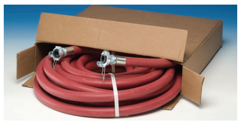
Shipped in 50 ft. length cartons.