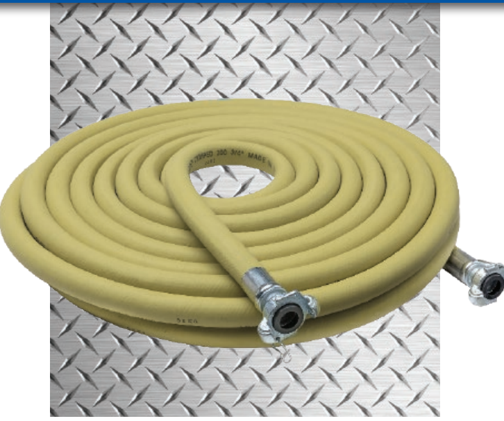
50 ft. assembled lengths.