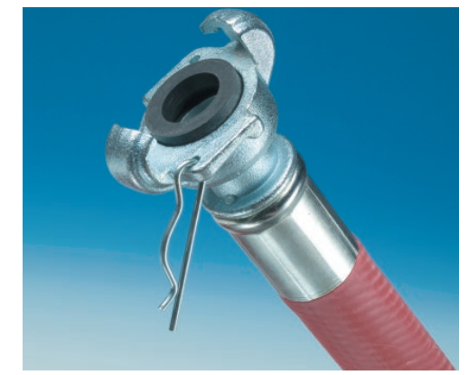
Assembled using crimped steel fittings.