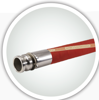
CONTINENTAL PLICORD BREWLINE HOSE