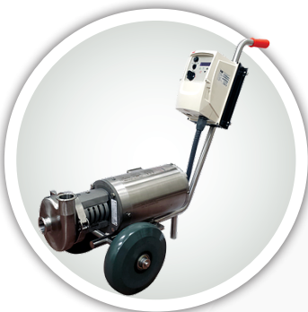
AMPCO CELLAR CART FOR BEER & CIP