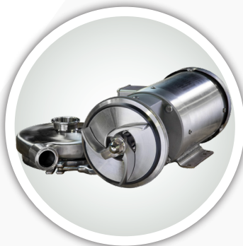
AMPCO CB+ CRAFT BREW PUMP