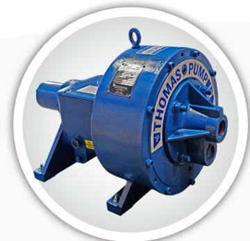
THOMAS HIGH PRESSURE PUMPS