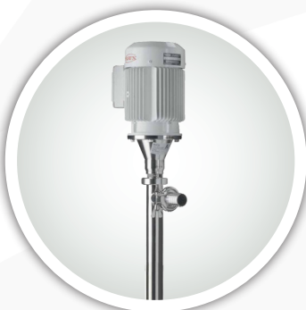
FLUX DRUM PUMPS