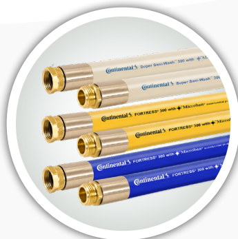
CONTINENTAL WASHDOWN HOSE