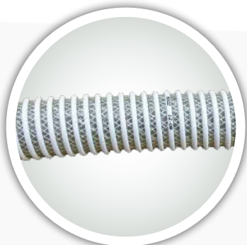
CONTINENTAL NUTRIFLO SUCTION & DISCHARGE HOSE