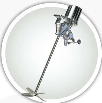
SHARPE PORTABLE MIXER