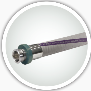
CONTINENTAL VINTNER RESERVE HOSE