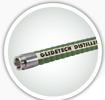
TUDERTECHNICA GLIDETECH DISTILLERY HOSE