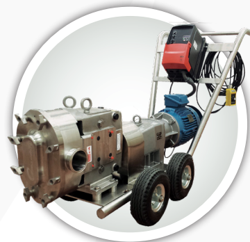
AMPCO WINE, MUST & YEAST CART