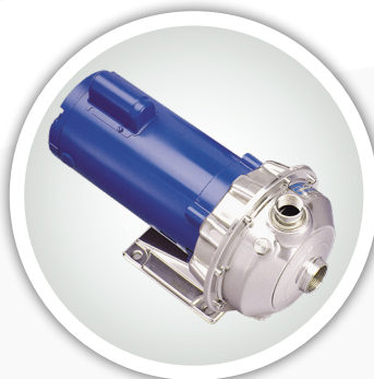
GOULDS CENTRIFUGAL PUMP