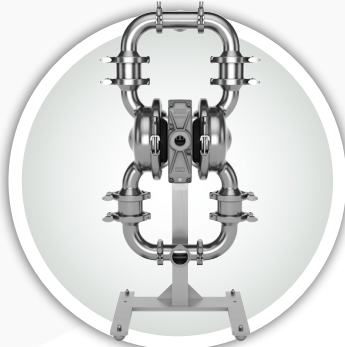
WILDEN DIAPHRAGM PUMP