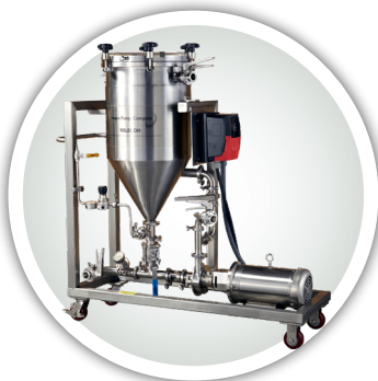
AMPCO ROLEC DH INDUCTION SYSTEMS