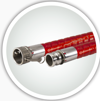
CONTINENTAL PLICORD EXTREMEFLEX BEVERAGE HOSE