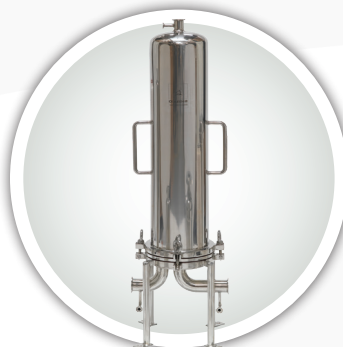
SHELCO HOUSINGS & FILTERS