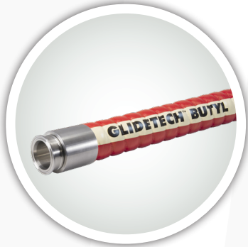
TUDERTECHNICA GLIDETECH BUTYL HOSE