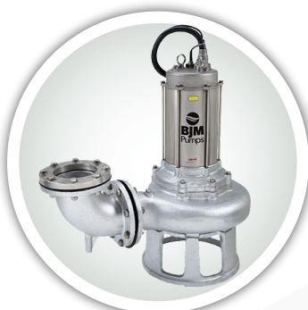
BJM SUBMERSIBLE PUMP