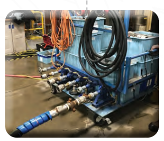
Mobile & Convenient