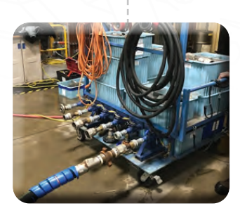
Mobile & Convenient