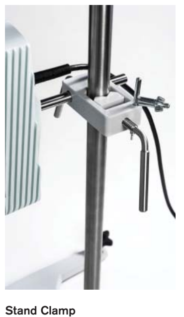
Stand Clamp #289826PSP