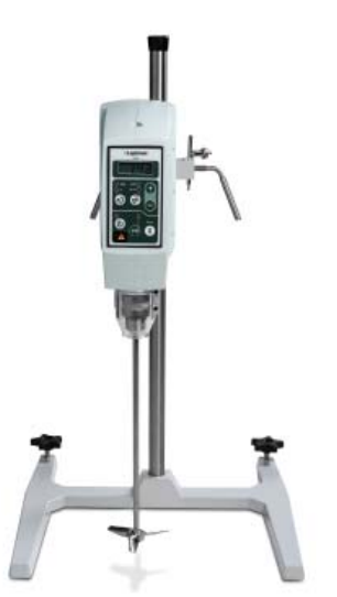
Premium Stand (1" dia. rod) #289827PSP