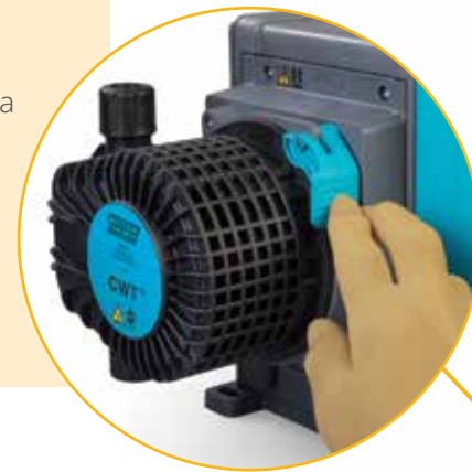
No-tools, quick and easy pumphead replacement

Low maintenance. No valves or seals to clog, leak or corrode