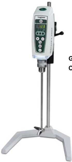
GP2 Universal Clamp Mount