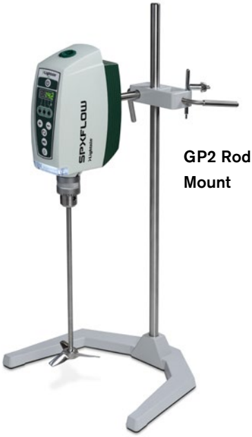
GP2 Rod Mount